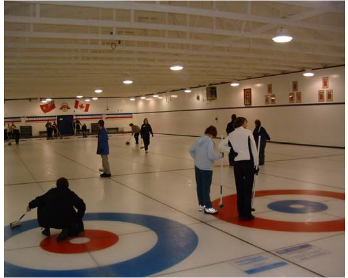
The ladies in action

Thank you to all those who participated in this popular event.